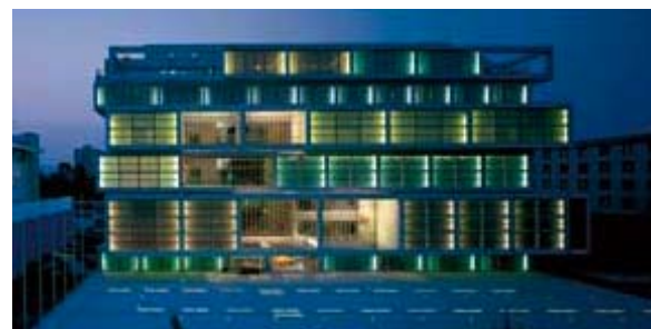
Chamber of Commerce - Ljubljana

Furthermore participants exchanged views on fee levels, and low-bid versus qualifications-based procurement procedures.